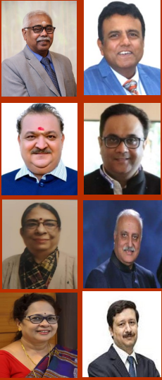
OUR DYNAMIC IMA AMS TEAM